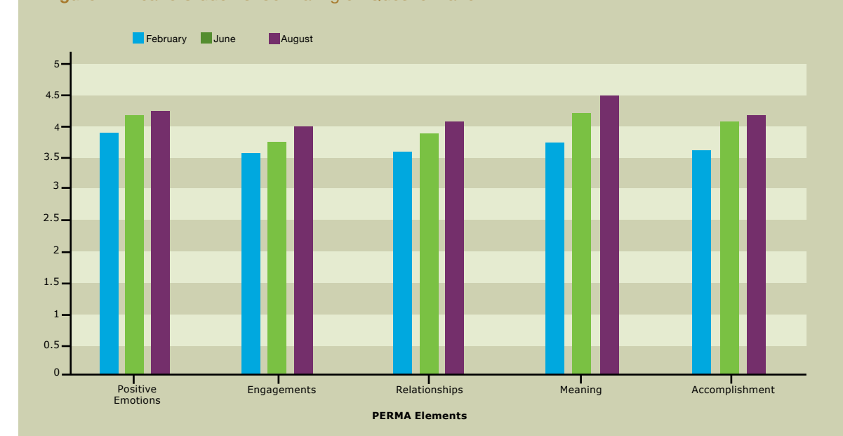
Figure 1: Year 3 Students’ Self-rating on Questionnaire

“Results ... indicated a significant difference between the pre-test and subsequent post-tests for ... Relationship, ... Meaning ... and Accomplishment”