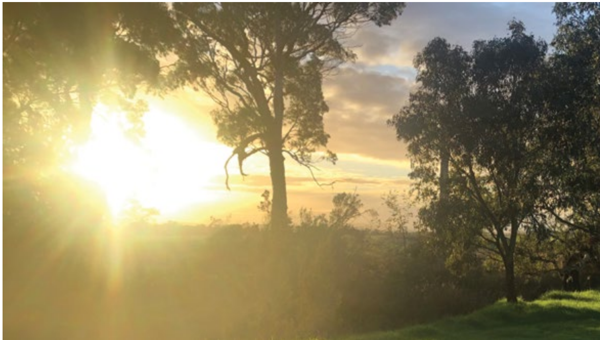
Figure 1: The Hillcrest Environmental Reserve (previously - the wetlands) is 10acres at the back of our school